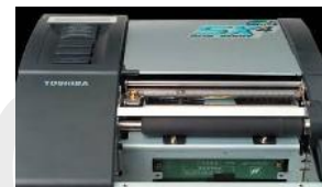
UHF RFID Antenna