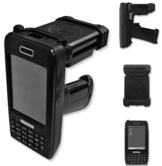
Fig. 1: Data Gun - Handheld RFID/Barcode